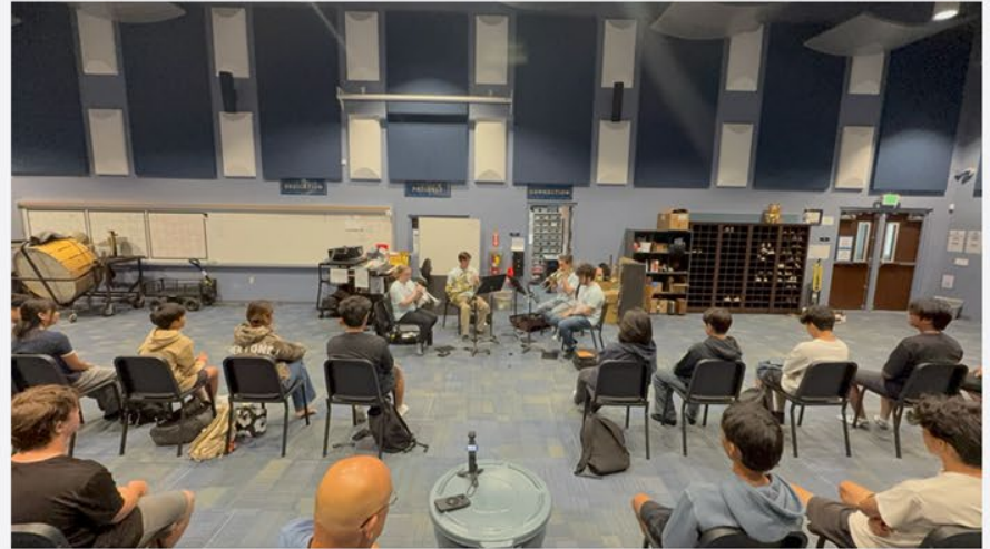
OLA fellows performing at Maui High School