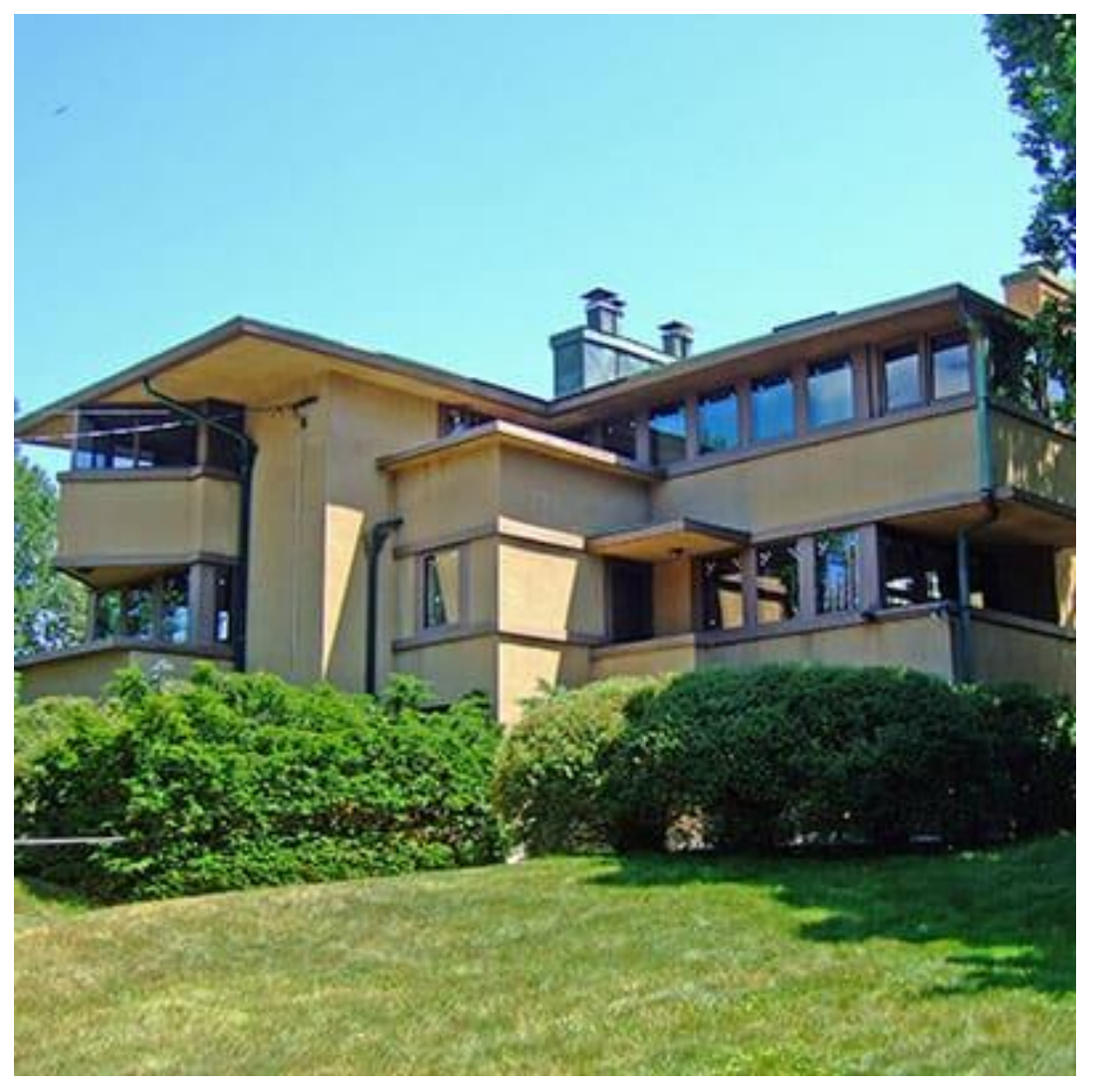
Historic Home Tour