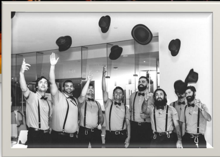
Kansas City Symphony Gala 1983 - 2022