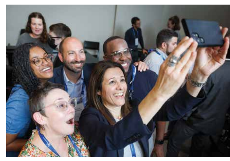
Alumni reception at The Juilliard School, July 2023.