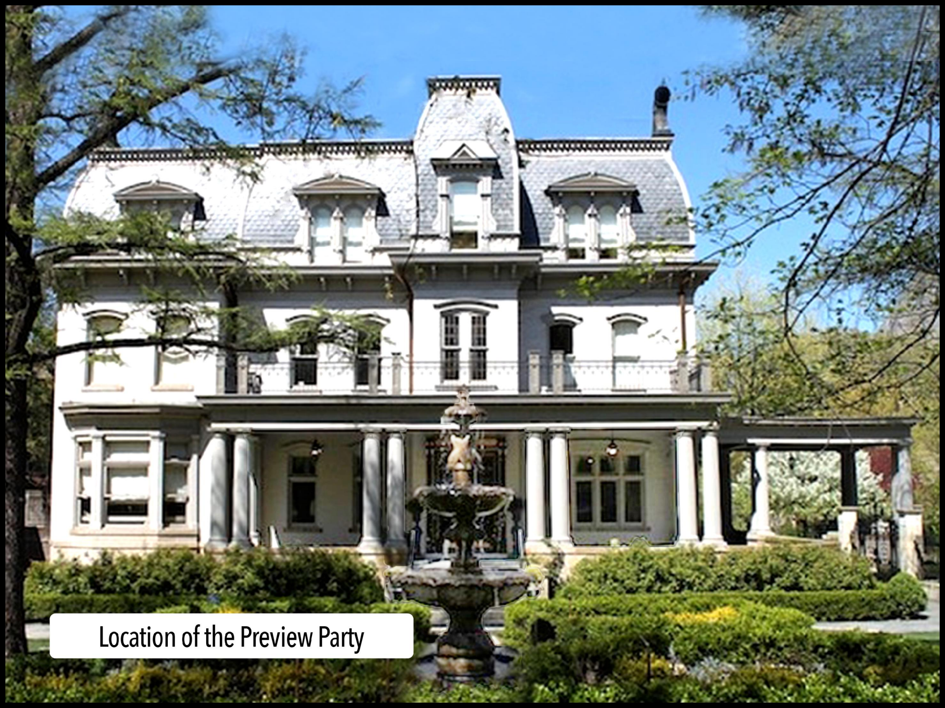
Location of the Preview Party