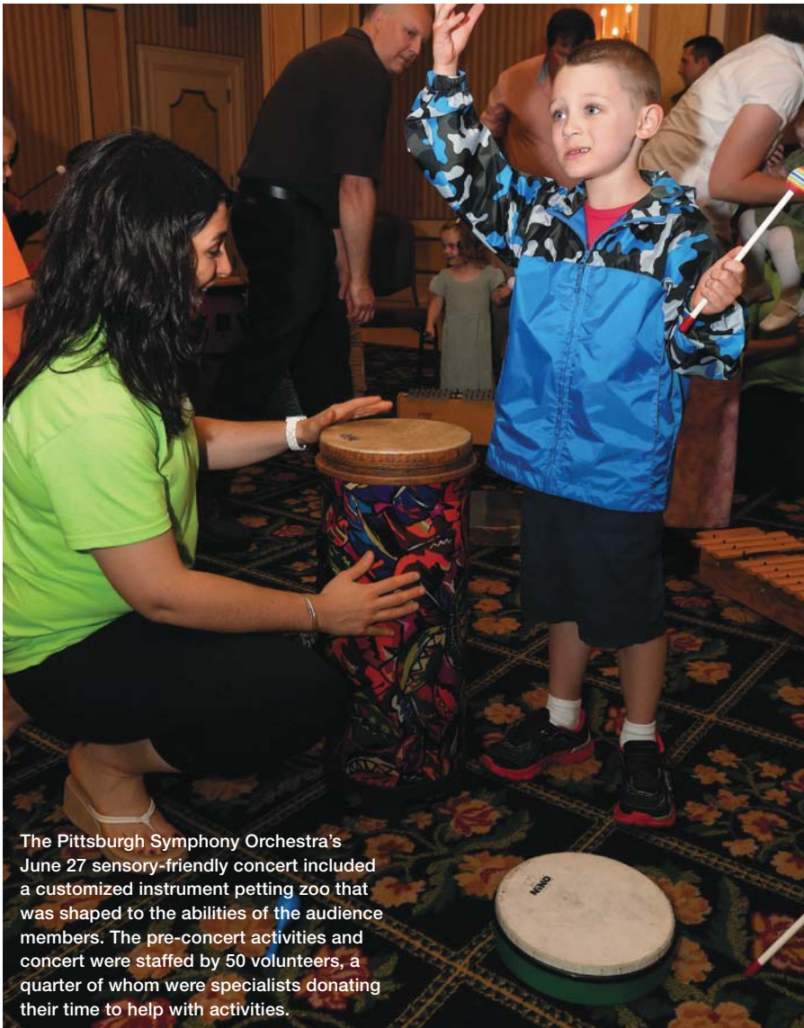
The Pittsburgh Symphony Orchestra's June 27 sensory-friendly concert included a customized instrument petting zoo that was shaped to the abilities of the audience members. The pre-concert activities and concert were staffed by 50 volunteers, a quarter of whom were specialists donating their time to help with activities.