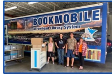
The Arrowhead Library System has 30 libraries + bookmobiles

SLIDE 6—Then we had a BIG new idea: we created Kinder Konzerts in a Bag for Libraries. Because our goal is to advance literacy in addition to music, the libraries were all in! We figured out a less expensive version while maintaining the quality, and we used a bag rather than a box. We included the book, a couple instruments, craft and printed materials for 3 children, and a folder with lessons. Our biggest order of a thousand bags was from the Arrowhead Library district, the large northern third of MN, bordering Canada. Families throughout the state could access the videos online and expand the reach of the MN Orchestra. Online they could hear musicians introduce their instruments, and become familiar with Orchestra Hall. In the future when families from around Minnesota visit Minneapolis, they can feel comfortable walking through our doors.