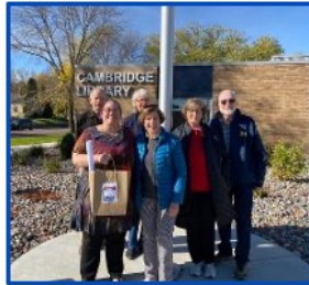
A Delivery to Cambridge, MN