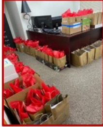
Library Bags ready to go