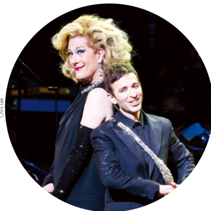
Justin Vivian Bond and Anthony Roth Costanzo in performance with the New York Philharmonic and Music Director Jaap van Zweden as part of Costanzo's residency with the orchestra this season.

Our art is greatly influenced and changed by connecting with other artists, other audiences, and working to create community. When I was thinking about "Authentic Selves" at the Philharmonic, I realized that nobody wants to see an "opera singer" onstage, people want to see a human being. In an orchestra concert, there are no costumes and no characters. It's just you. That is what moves people about music: the human part. Without