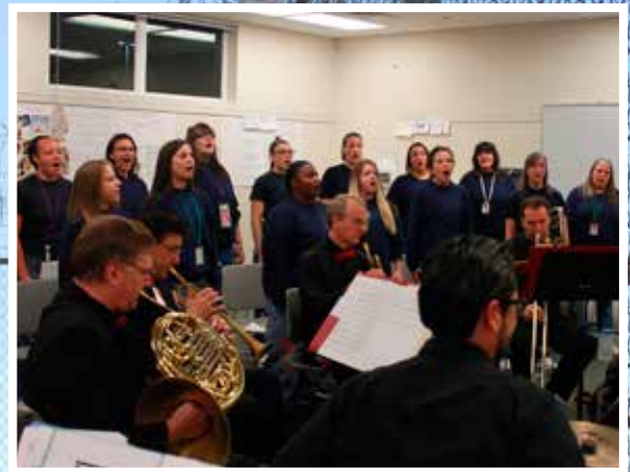
Coffee Creek Correctional Facility