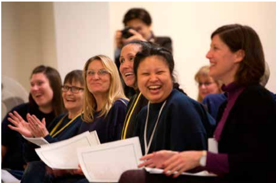
Inmates at the Coffee Creek Correctional Facility take in an Oregon Symphony performance.

Also under the umbrella of the Seattle Symphony's Simple Gifts initiative is a lo-