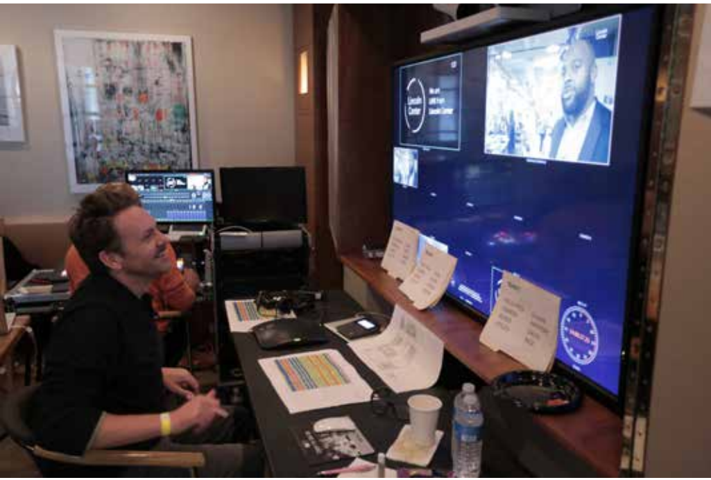
Heigh Sivad/Lincoln Center for the Performing Arts