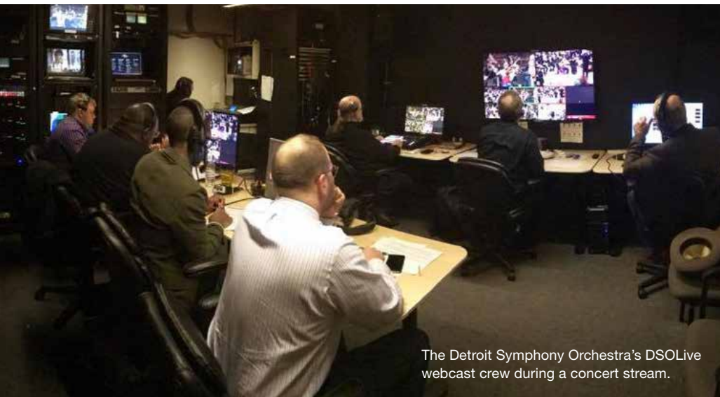
The Detroit Symphony Orchestra's DSOLive webcast crew during a concert stream.

Online visual simulcasting of orchestra performances has lagged behind theater and opera, possibly because of the art form's more subtle visual drama. Potential