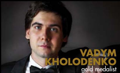
VADYM KHOLODENKO gold medalist