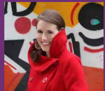
NAOMI LOUISA O'CONNELL mezzo-soprano