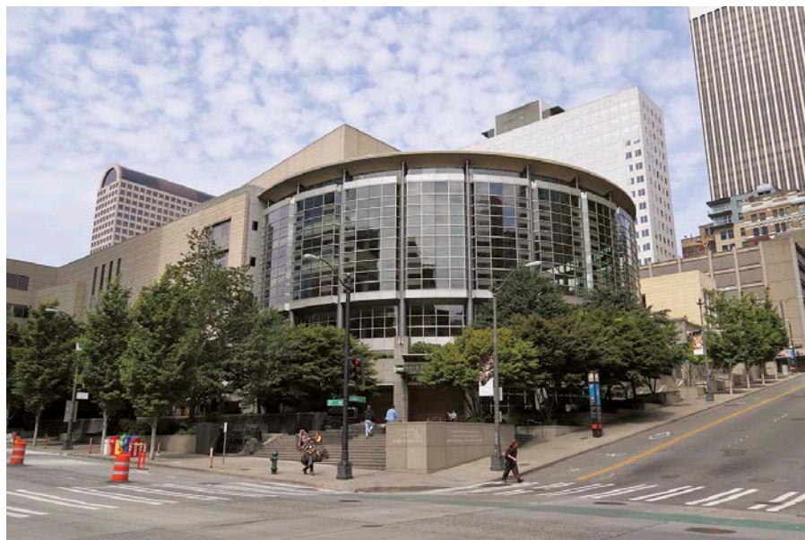
Benaroya Hall, home of the Seattle Symphony

To encourage newcomers to return, the Seattle Symphony now also focuses on improving the customer experience. It has scheduled sessions with a highly regarded hospitality industry consultant to train employees, from box office to parking attendants. In workshops, they learn to welcome guests warmly, with a smile, to