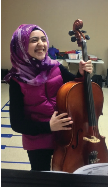
A young cello student in the Kalamazoo Symphony Orchestra's new Orchestra Rouh program for recently resettled refugees.