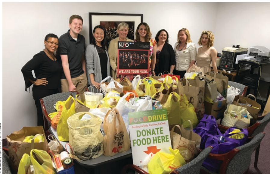
New Jersey Symphony Orchestra staff members with donations at one of the concerts where they collected food.

have participated in the 2017 food drive so far, ranging from Eastern Connecticut Symphony Orchestra to the Sioux City Symphony Orchestra to Northern Valley Youth Orchestras in North Dakota. Since January, more than 29,173 pounds of food have been collected. The Orchestras Feeding America food drive continues throughout the year, so there’s plenty of time to join the effort to help those in need in your community. Visit the Orchestras Feeding America section at www.americanorchestras.org to learn more.