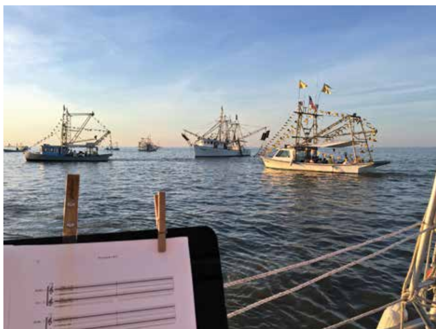
The Louisiana Philharmonic performed Yotam Haber’s New Water Music near the Seabrook Boat Launch on Lake Pontchartrain in April—from shrimp boats. Top, Philharmonic horn players en route to the performance.