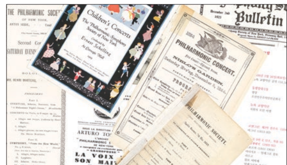
Concert programs from the New York Philharmonic Leon Levy Digital Archives.

Not that long ago, orchestra archives were accessible only to scholars and researchers, the specialists who were granted permission to delve among historic treasures. Now, via digital technology, more and more orchestras and musical organizations are opening their archives to anyone, anywhere. It takes a lot of scanning and sleuthing and software, but the results bring an orchestra's past vividly to life for fans, musicians, journalists, music-lovers, administrators, and others. The New York Philharmonic's Leon Levy Digital Archives document every concert the orchestra has given—tens of thousands since 1842—and behind-the-scenes artistic and administrative work. Two other orchestras recently an-