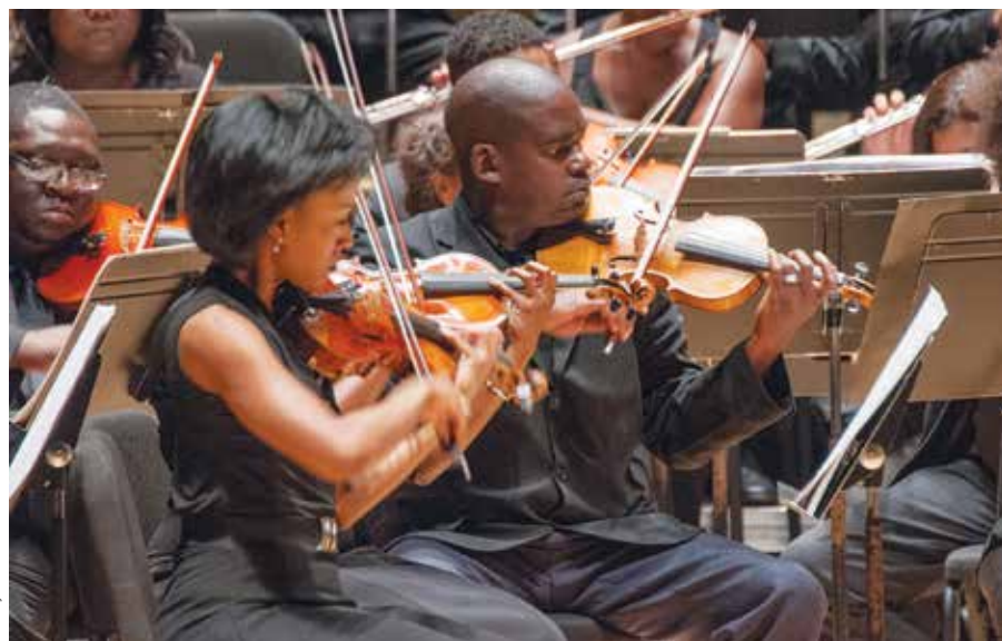
Gateways Music Festival