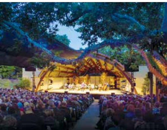
Ojai Music Festival

At the Ojai Music Festival in bucolic southern California, the milieu is one of the attractions.