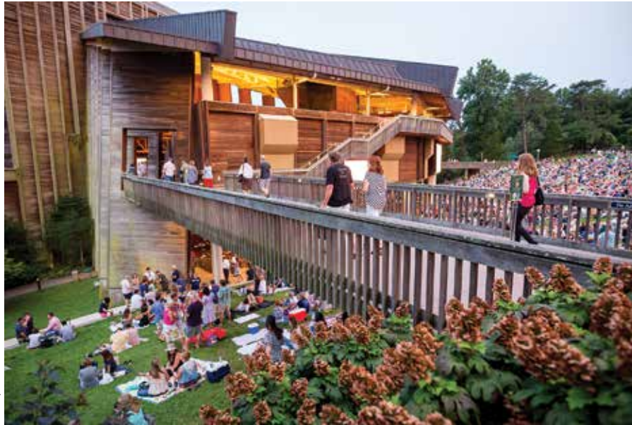
The annual Wolf Trap festival in Virginia draws audiences to music by a wide range of artists and ensembles, including the National Symphony Orchestra, which has made Wolf Trap its summer home for decades.