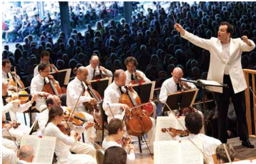
The Boston Symphony Orchestra, led here by Music Director Andris Nelsons, is at the center of the music-making at the Tanglewood festival in Lenox, Massachusetts.