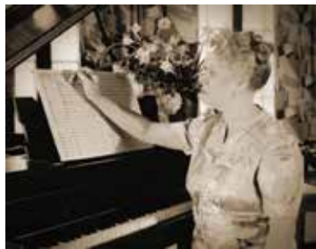
Composer Florence Price, at the piano in 1941.