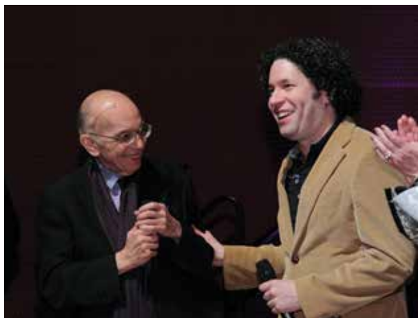
Conductors and fellow Venezuelans Gustavo Dudamel and José Antonio Abreu

nal and unwavering. This is also a commitment to the millions of young people and children in Venezuela and around the world, who, like me, saw how their lives gained meaning at the very moment they were touched by music. My commitment to Maestro Abreu and El Sistema is a commitment to the future, to those children who have not yet discovered music and art. To these children, and to the millions touched by Maestro Abreu's legacy, I would like to say that this is just the beginning of the journey.