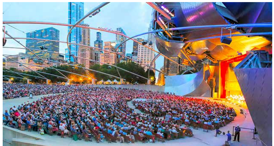
Grant Park Music Festival