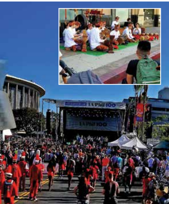
On September 30, the LA Phil celebrated its 100th birthday by hosting a free festival, complete with food trucks, gamelan orchestras (inset), and more, on the eight-mile route between its two homes: Walt Disney Concert Hall and the Hollywood Bowl.