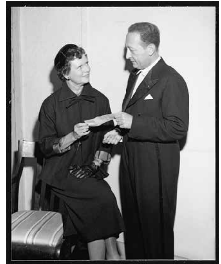
In 1964, the LA Phil moved to the Dorothy Chandler Pavilion in the brand-new Music Center, its home until 2003. Above, namesake Dorothy Chandler backstage at the Dorothy Chandler Pavilion with Jascha Heifetz.

The move to the Dorothy Chandler Pavilion coincided with a remarkable period of growth for the orchestra, spearheaded