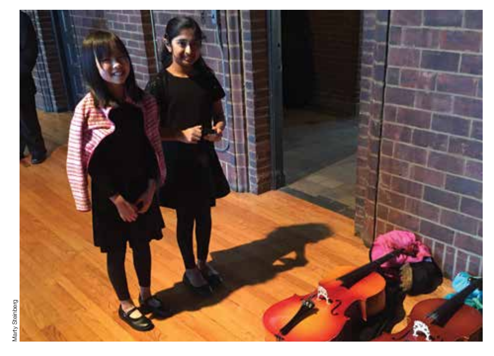
Two aspiring cellists, members of the New Jersey Intergenerational Orchestra. The orchestra's members range in age from 8 to about 80, and perform in one of three different ensembles, depending on the level of experience.

youth and skill all the time. So they learn all the ways you can handle the problems that come up when you can't necessarily play the passage." For NJIO's 25th season, Cohen selected works including Schubert's "Unfinished" and Dvořák's "New World" symphonies. The Dvořák is especially challenging, but "I knew a lot of people wanted to play it," he says. "I put that as a goal and we did a lot of things as we were prepping for it. I think