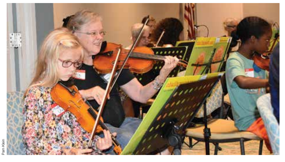
The Florida Intergenerational Orchestra's violin section spans many ages, including the sevenyear-old seen above.

tiple studies have noted quality-of-life benefits: sustained mental sharpness from reading music and fitness and coordination from playing a musical instrument. Listening to music is also beneficial. A 2017 National Endowment for the Arts survey on public participation in the arts showed that nearly 54 percent of the U.S.