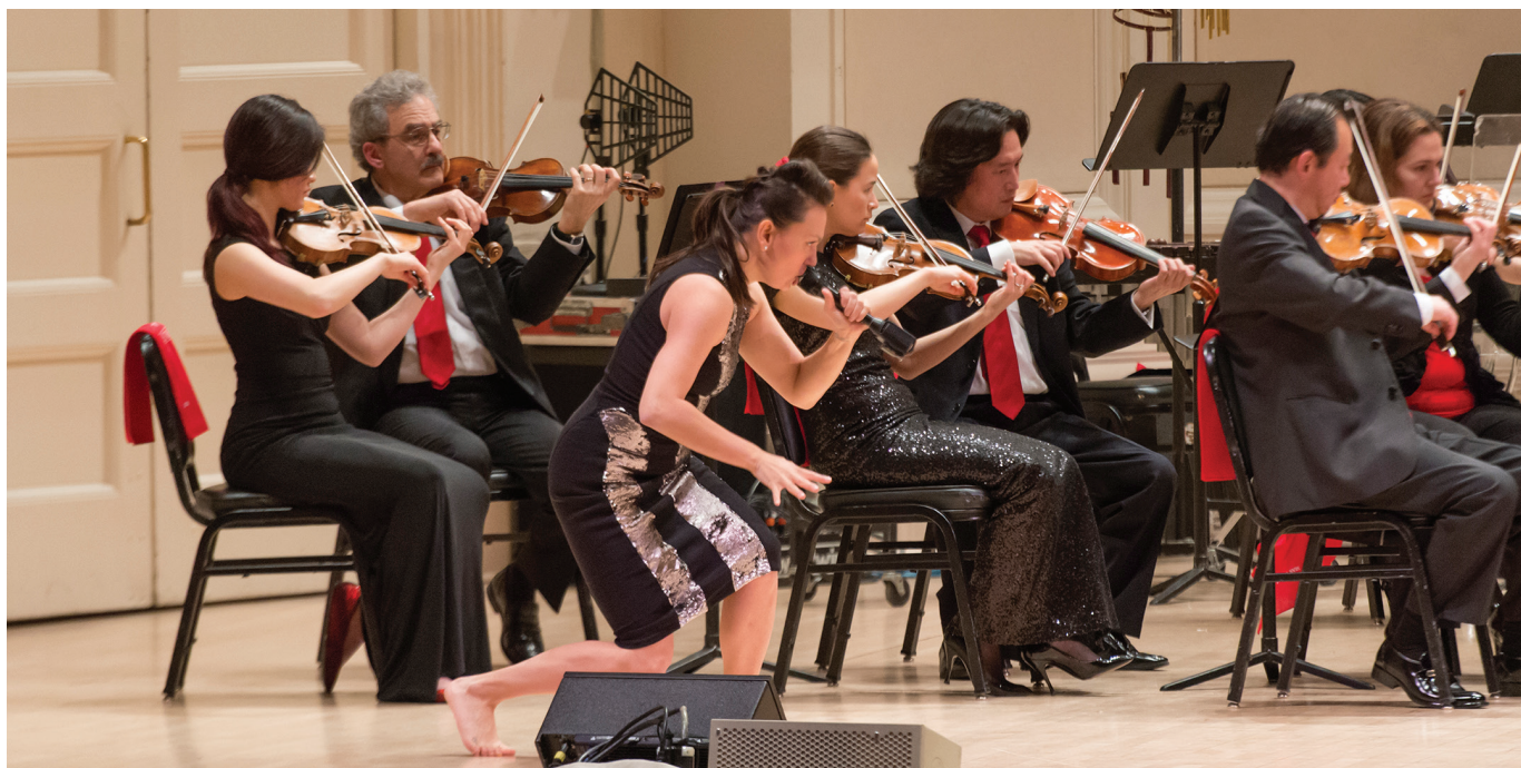
Winnipeg Symphony Orchestra

Tanya Tagaq, an Inuk throat singer and artist from Cambridge Bay (Iqaluktuuttiaq), Nunavut, has appeared with Canada’s Winnipeg Symphony Orchestra, including at the orchestra’s 2014 concert at Carnegie Hall in New York.