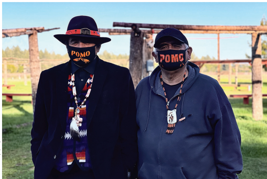
San Francisco Symphony