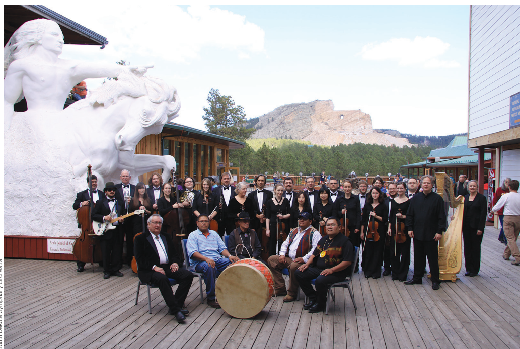
The South Dakota Symphony Orchestra and the Porcupine Singers in front of Crazy Horse Memorial after a Native Americans’ Day performance of the Lakota Music Project at the Memorial in 2010.

Creating meaningful partnerships with Indigenous composers and communities takes time to develop, but an increasing number of orchestras are eager to try. Spurred by a desire to diversify institutions that are among the least racially diverse, orchestras are looking for ways to bring underrepresented voices into the field. As a result, Native American classical compos-