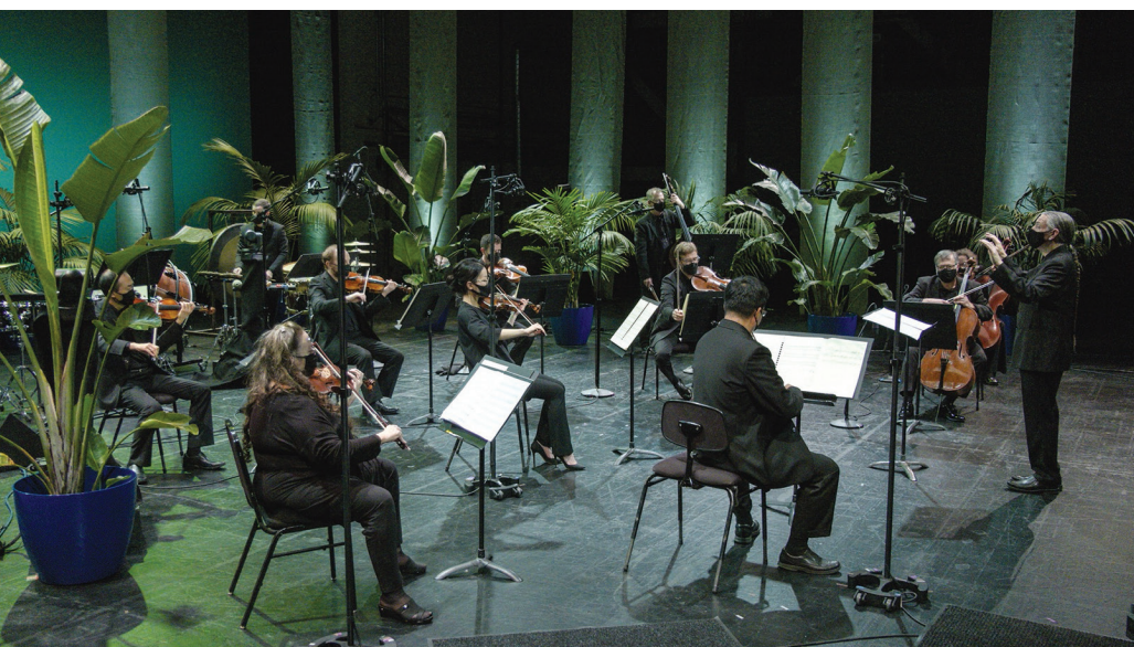
San Francisco Symphony