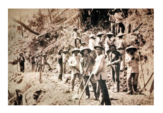
Immigrants from China were among the workforce that constructed the Transcontinental Railroad.

The Reno Philharmonic was looking for a way to celebrate its 50th anniversary in 2019 with a commission, when the orchestra realized it coincided with another major anniversary: the sesquicentennial of the completion of the nation's first transcontinental railroad. "We just got more and more excited when we realized how seminal the Transcontinental Railroad was to our community," recalls Tim Young, president and CEO of the Reno Philharmonic. "I think many people here don't realize that Reno only exists because of the Transcontinental Railroad. Charles Crocker [one of the four founders of the Central Pacific Railroad] stood outside what became the city and pulled the name out of a hat. The name was Jesse Lee Reno. And Crocker said, 'Okay, this town is going to be named Reno.' The next day the lots went on sale, and that's how the town began in 1868."