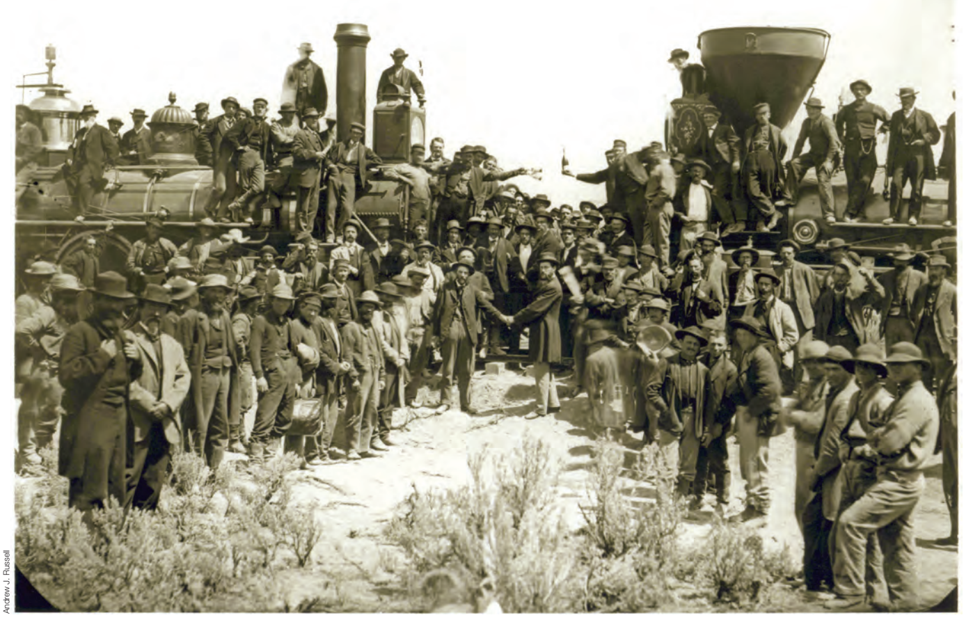
The Golden Spike: Celebrating the meeting of the Central Pacific and Union Pacific rail lines on the newly completed Transcontinental Railroad at Promontory Summit, Utah, May 10, 1869.