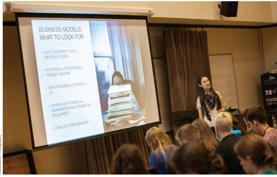
At Fifth House Ensemble's two-week Fresh Inc Festival, emerging classical musicians get a grounding in some of the business principles behind a career in the arts.

these activities are built on a base of rocksolid musicianship, they also involve specific skill sets—grant writing, marketing, audience development—that aren't typically included in a fledgling musician's formal training.