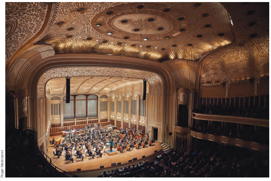
Student ensembles from the Cleveland Institute of Music regularly perform in the elegant environs of Severance Hall, the home of the Cleveland Orchestra.

Old or new, there are some challenges that all these programs face. How do you