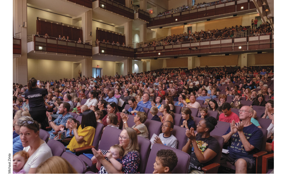
Meymandi Concert Hall was packed for the North Carolina Symphony's September 2019 sensoryfriendly concert, designed for children and adults with autism and sensory sensitivities