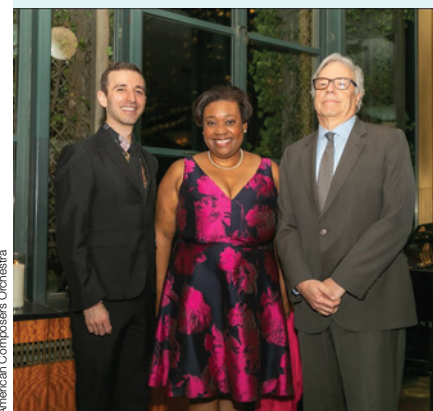
American Composers Orchestra