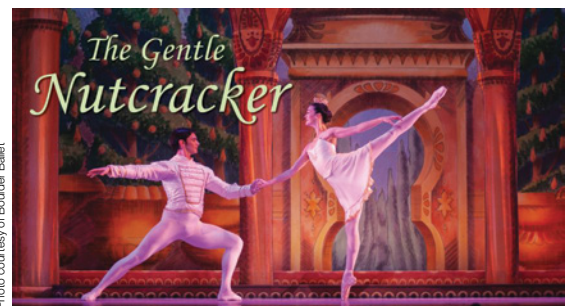
Promotional material for the Longmont Symphony Orchestra and Boulder Ballet's sensory-friendly production of The Gentle Nutcracker .