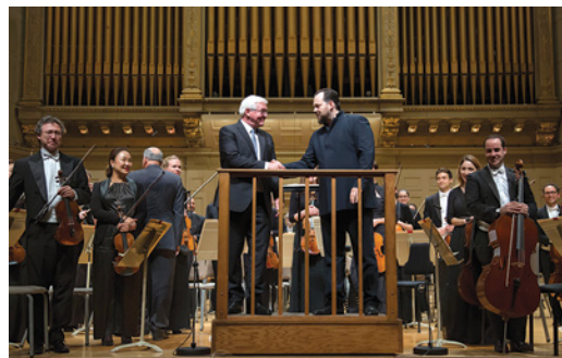
German Federal President Frank-Walter Steinmeier with BSO Music Director and Gewandhaus Orchestra Kapellmeister Andris Nelsons at Boston's Symphony Hall on October 31, 2019.

Richard Strauss's Festive Prelude for organ and orchestra calls for a massive ensemble, and this fall the combined forces of the Boston Symphony Orchestra and the Leipzig Gewandhaus Orchestra delivered—to the tune of 118 musicians onstage at Boston's Symphony Hall, which extended its stage by thirteen feet for the event. The October 31 gala performance highlighted the BSO/GHO Alliance, a five-year partnership between the Boston Symphony Orchestra and Gewandhausorchester launched in February 2018 by Andris Nelsons, who is music director of both orchestras. The alliance also features co-commissions, educational initiatives, and more. It was the first full residency in Boston for the Leipzigers, a week that included five performances by musicians from both ensembles, separately and together. German Federal President Frank-Walter Steinmeier was on hand on October 31 to welcome the audience and announce the official culmination of the Federal Republic of Germany's year-long celebration of its friendship with the United States. The program also included Haydn's Sinfonia concertante in B-flat for oboe, bassoon, violin, and cello, Schoenberg's Verklärte Nacht , and Scriabin's Poem of Ecstasy . At the end of the performance, there were beer and pretzels: what would a German-American fest be without that?