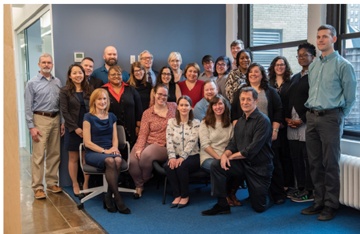
League staff at the new office.

League of American Orchestras 520 8th Avenue Suite 2005, 20th Floor New York, NY 10018